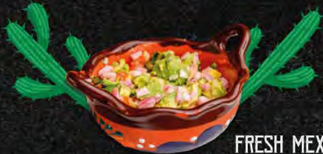
FRESH MEXICAN GUACAMOLE