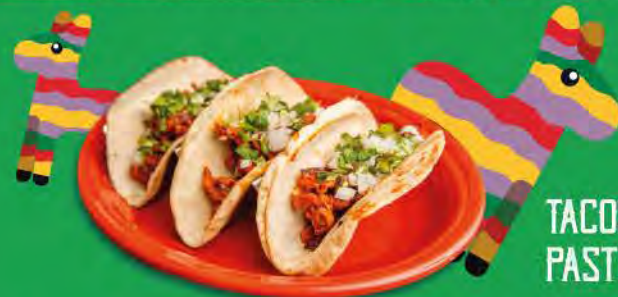
TACOS AL PASTOR

* Consuming raw or under cooked meats, poultry, seafood, shellfish, or eggs may increase your risk of food borne illness.*