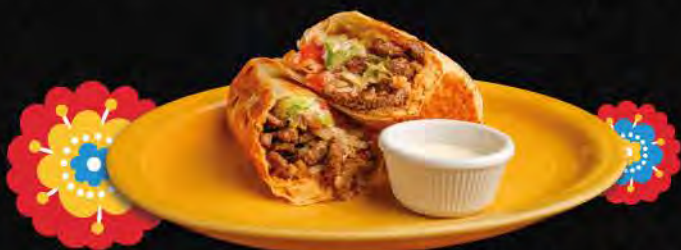
THE BIG MULE

* Consuming raw or under cooked meats, poultry, seafood, shellfish, or eggs may increase your risk of food borne illness.*